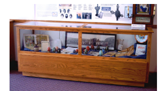
Display cabinet at Česka Radnice